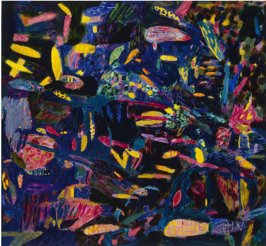
Figure 1: Coral garden V 168 x 183cm

Born 29 June 1940 in Sydney, Ken left school at 14 to enter the National Art School in East Sydney. After five years of study, he commenced a highly successful career as an art director and designer in New York, London and Sydney. At the age of 40 he gave up his advertising career to become a painter full-time. Since then, he has held over 50 one-man shows, including major exhibitions in Australia, Europe, Japan and the USA. This year Ken was a finalist in both the Wynne and Sulman prizes at the Art Gallery of NSW. He has been a finalist in the Archibald Prize as well as the Dobell prize for drawing. Working with underprivileged children has always been an important part of Ken's vocation and commitment to his community. In 1988 Ken Done was appointed as an Australian Goodwill Ambassador for UNICEF and in 1992 Ken received the Order of Australia (AM), for services to Art, Design and Tourism.