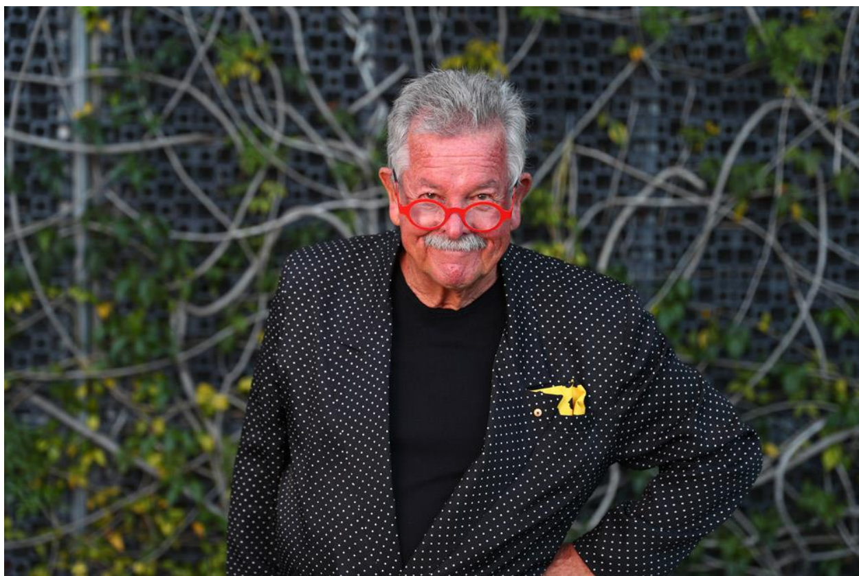
Figure 3: Artist Ken Done at Gallery One